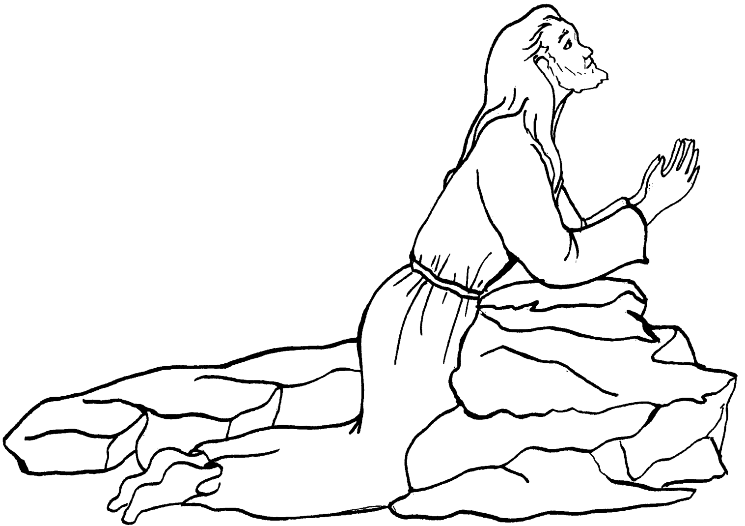
"Jesus prays in the Garden of Gethsemane" Luke 22:39-53