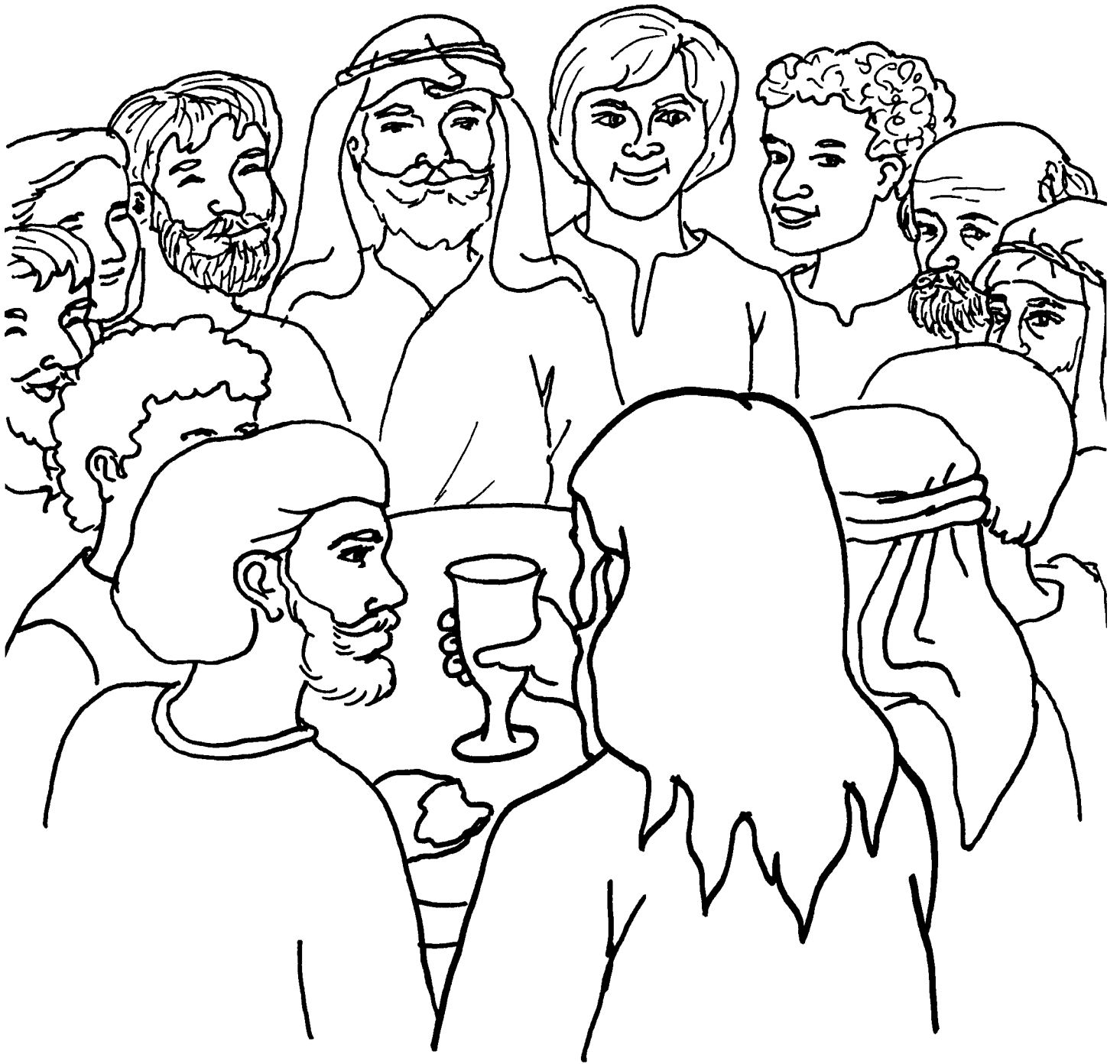
"Jesus presents the new covenant to His disciples at the last supper." Luke 22:7 – 20