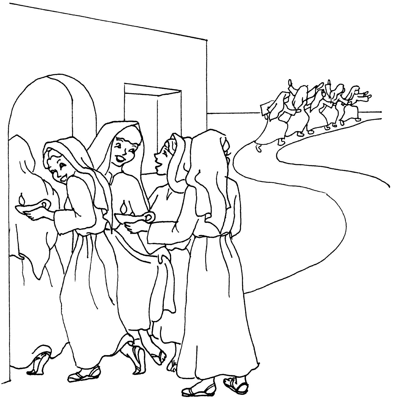
"Jesus tells a parable about ten maidens." Matthew 25:1-13