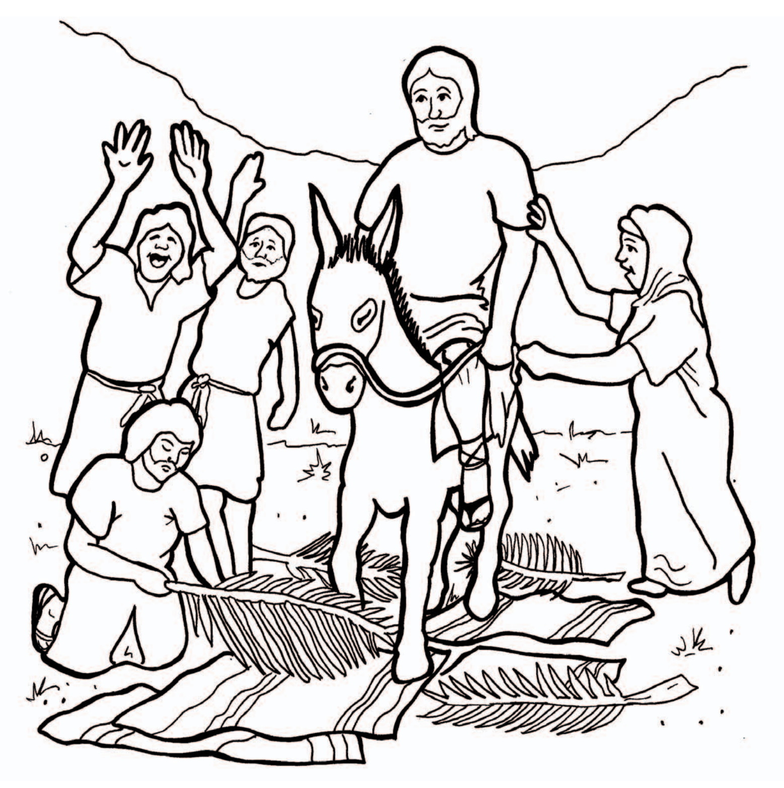
"Rejoice greatly, O daughter of Zion! Shout, O daughter of Jerusalem! Behold, your King is coming to you; He is just and having salvation, lowly and riding on a donkey, a colt, the foal of a donkey."

(ZECHARIAH 9:9-11; 11:12-13; 12:10-11; 14:3-9)